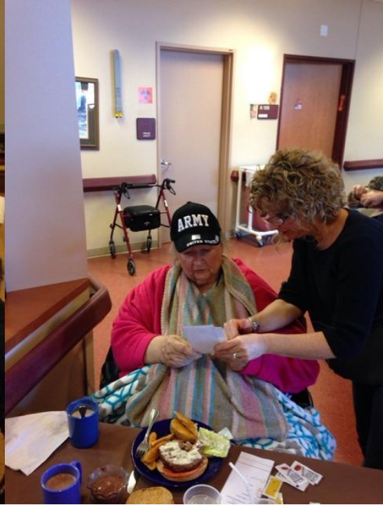
March Veteran's Home Bingo-Ice Cream Social